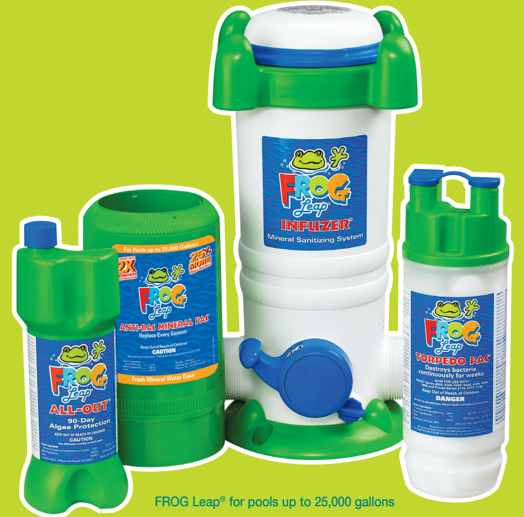
FROG Leap ® for pools up to 25,000 gallons

Cleaner, Clearer, Softer. It's Easier too!